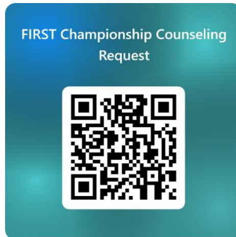
Figure 1: Counseling Request QR Code